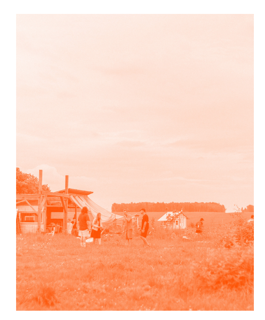
Salon Rouge, 2022.

We live on Twana and S'Klallam land in the foothills of the Olympic Mountains. This ecosystem—once a dynamic forest tended to by people, elk, bears, eagles, beavers, and salmon—is now a patchwork of tree plantations, offgrid homes, and clearcuts (results of logging practices in which all trees in an area are uniformly cut down). A century of white settlement, logging, and cattle grazing on the land we now tend has resulted in a wetland dominated by invasive grasses, stands of second-growth conifers, and a west-facing slope clearcut in 2014. Above us lies a commercial tree plantation owned by